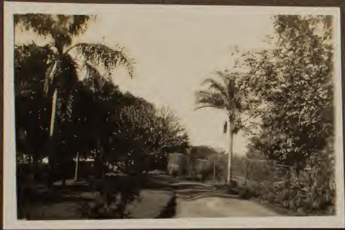
Muller's Training Base